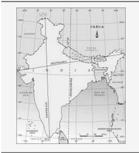
India : Extent and Standard Meridian