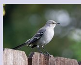
The Northern Mockingbird