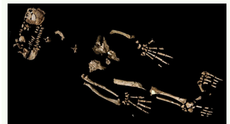
Partial skeleton of Ardi ( Ar. ramidus )